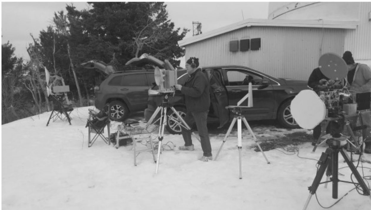
Figure 12 W5LUA, K8ZR, & VE4MA with 78 GHz on Mt Lemmon