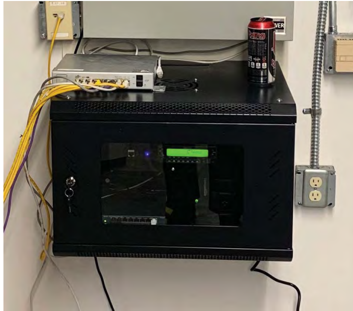
(The Ethernet switch is not part of the MRN.)