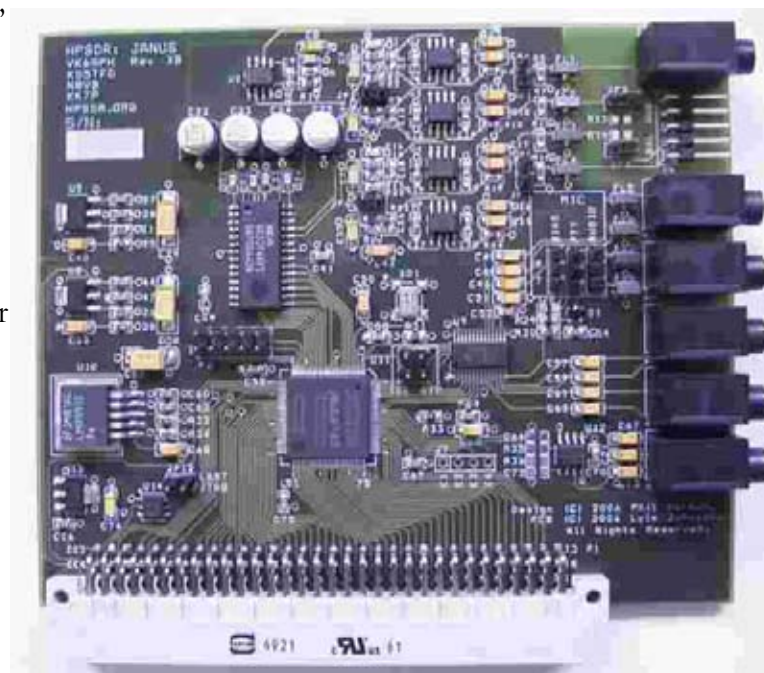
FIGURE 1. JANUS

USB2/IO board and the Janus sound board. Ozy provides local logic on the Atlas bus, and connects back to a PC via a USB 2 connection. The board has a Cypress FX2 EZ-USB microcontroller to handle the USB 2 connection and a large Altera FPGA to