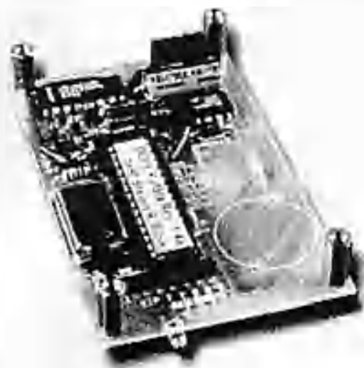
Differential GPS Reference Station Interface Board