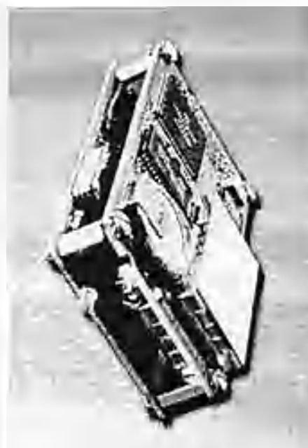
Example of Oncore attached to DGPS Interface Board

Setup of the DGPS Reference Station is easy. The output baud rate and the Station ID is selectable via jumpers. The latitude, longitude, and altitude of the reference location and the rate at which corrections will be transmitted are programmed via software commands. The Reference Station then operates without any further intervention.